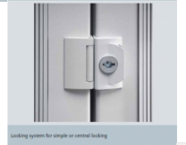
Locking system for simple or central locking