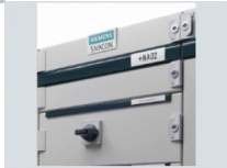
Standardized labelling system for sections and feeders