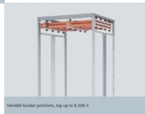
Variable busbar positions, top up to 6,300 A