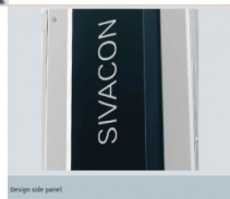
Design side panel